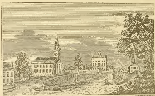
CENTRE OF WEST CAMBRIDGE IN 1817.