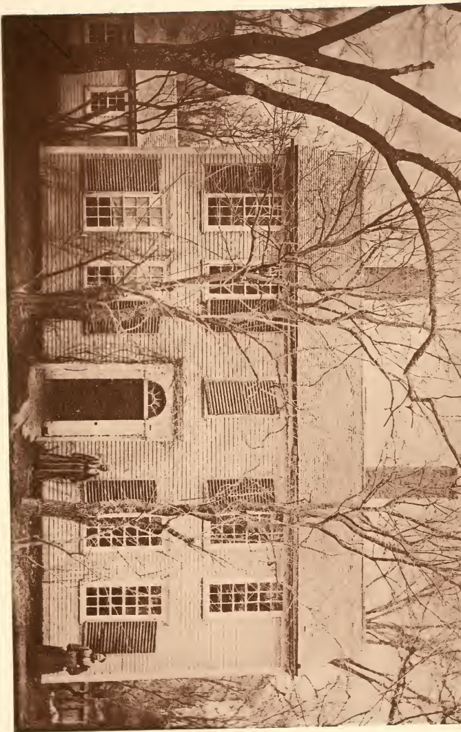
HOUSE OF THE REV. SAMUEL COOKE. 1740—1871.